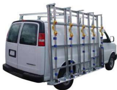
76 x 114 inch Single Van

Van racks for Ford, Chevy, Dodge and imported brands. Options for single side, double side and internal racks.