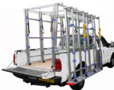
8 Foot Pickup Triple Rack

Van racks for Ford, Chevy, Dodge and imported brands. Options for single side, double side and internal racks.