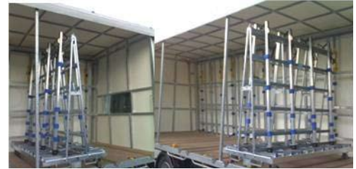
Transport A-frame System