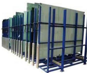
Stoebe Concertina rack systems

Storage systems including concertina and swing racks to reduce floorspace requirements and reduce access times.