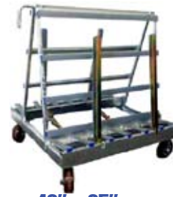
43" x 35"