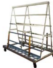
78" x 74"