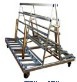
78" x 47"