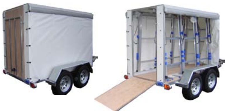
118 inch Glass Trailer