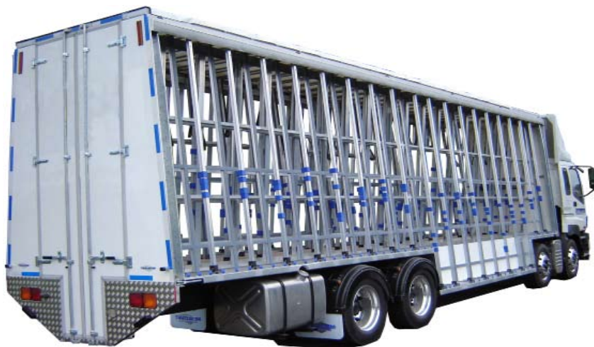
35 Foot 8 Wheel Glass Transporter Our glass transporters span from large to small