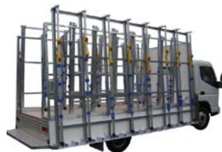
15 Foot Open Delivery Truck

Pick-up racks for all box lengths and box delete for all major brands. Options for single, double, triple and quad racks to suit your glass volume and weight requirements.