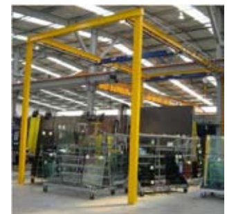
Lightweight Crane System

Transport A-frames to reduce double handling by loading direct from the factory machinery to a vehicle.